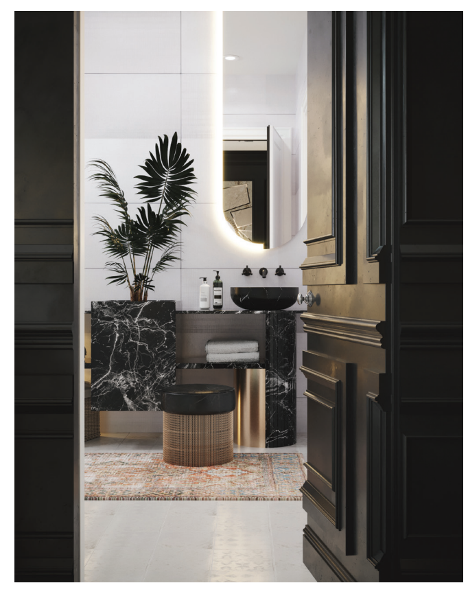
DESIGN IN DALLAS/FORT WORTH