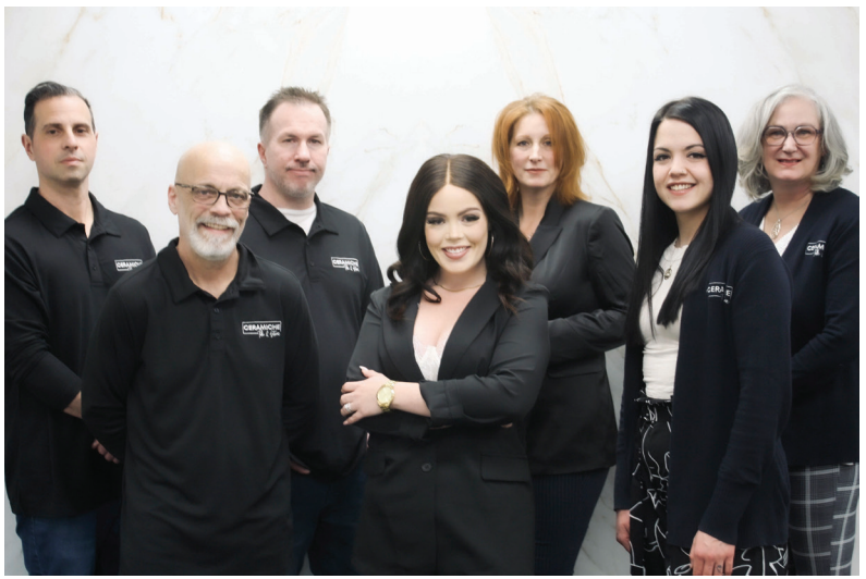
DESIGN IN PITTSBURGH